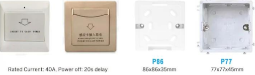
P86 P77 86x86x35mm 77x77x45mm

Rated Current: 40A, Power off: 20s delay