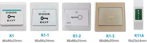
K1 K1-1 K1-2 K1-3 K11A 86x86x25mm 86x86x24mm 86x86x25mm 86x86x20mm 76x23x14mm