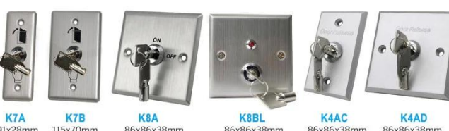
K7A K7B 91x28mm 115x70mm K8A K8BL 86x86x38mm 86x86x38mm K4AC K4AD 86x86x38mm 86x86x38mm