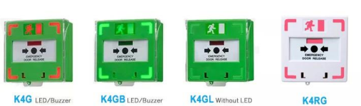
K4G K4GB K4GL K4RG LED/Buzzer Red LED/Buzzer Green Without LED 90x93x45mm