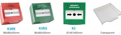
K3RR K3RG K3 Transparent 86x86x50mm 86x86x50mm 87x87x60mm