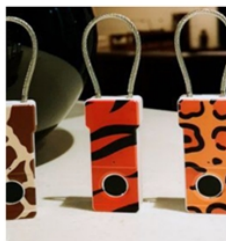
( ACM-Finger710A )