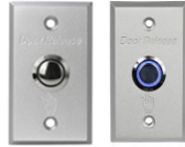
K4A K4AL 86x50x33mm