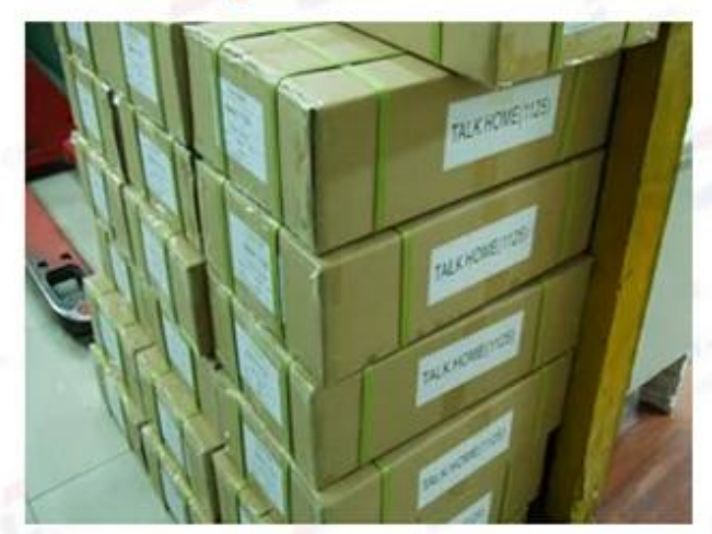
Outside Carton Package