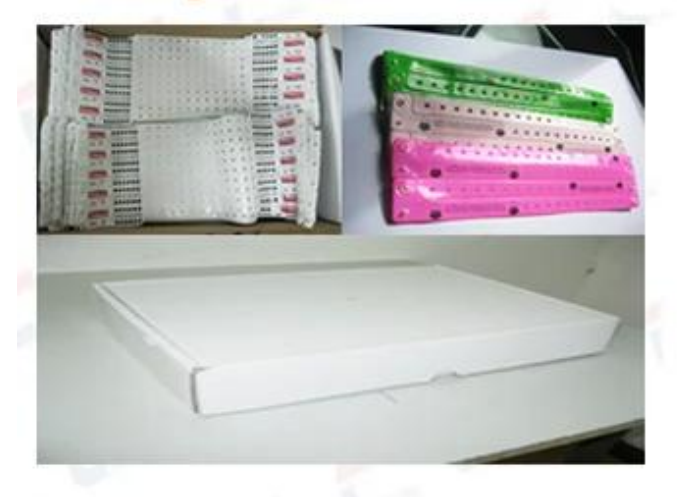
Package for Soft PVC/ Paper Wristbands