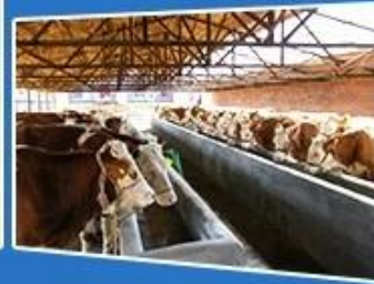
Product application scope