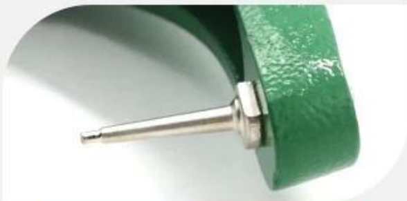
Special ear marker