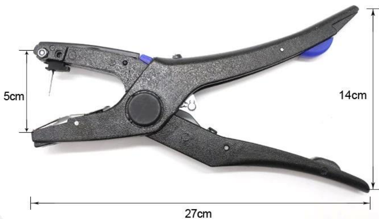
Automatic rebound ear tag pliers