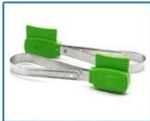
Metal Strap Seal