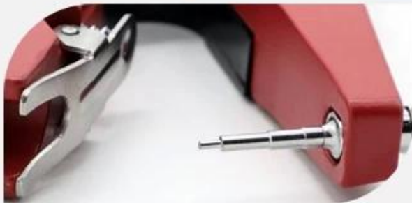
Special ear marker