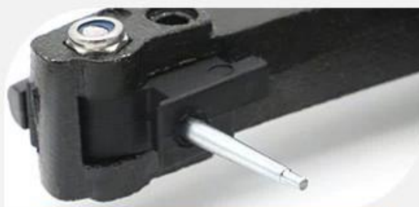
Special ear tag needle