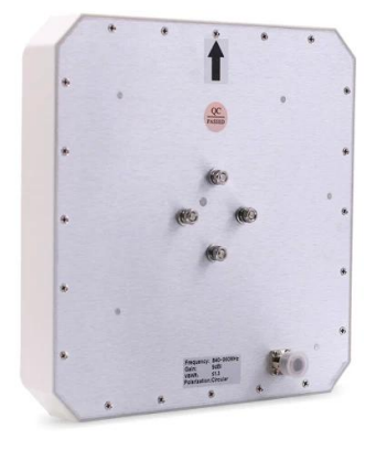
N-female,come with cable to connect with reader