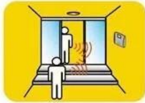
Personal ID access control