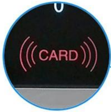
authorized cards, Green Led un-authorized cards, Red LED