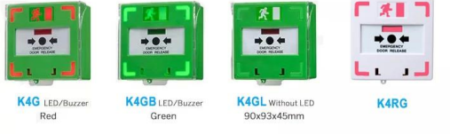
K4G K4GB K4GL K4RG LED/Buzzer Red LED/Buzzer Green Without LED 90x93x45mm