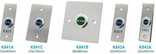
K841A K841C 115x40mm 115x70mm K841B K842A K843A 86x86mm 115x40mm 115x40mm