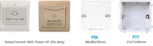
P86 P77 86x86x35mm 77x77x45mm