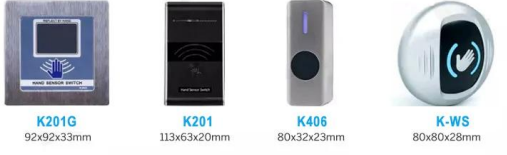
K201G K201 92x92x33mm 113x63x20mm K406 K-WS 80x32x23mm 80x80x28mm