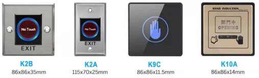
K2B K2A 86x86x35mm 115x70x25mm K9C K10A 86x86x11.5mm 86x86x14mm