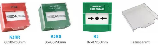
K3RR K3RG K3 Transparent 86x86x50mm 86x86x50mm 87x87x60mm