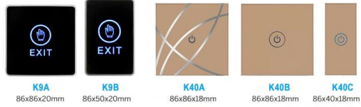
K9A K9B 86x86x20mm 86x50x20mm K40A K40B K40C 86x86x18mm 86x86x18mm 86x40x18mm