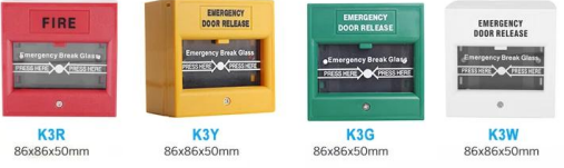
K3R K3Y K3G K3W 86x86x50mm 86x86x50mm 86x86x50mm 86x86x50mm