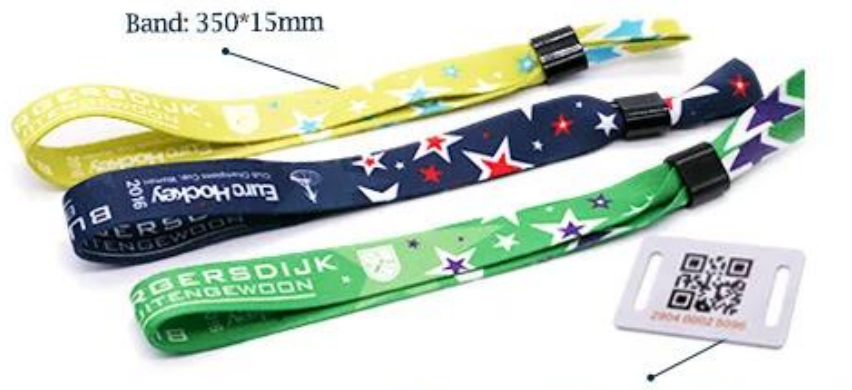
PVC tag: 42*26mm /40*25mm /36*25mm.