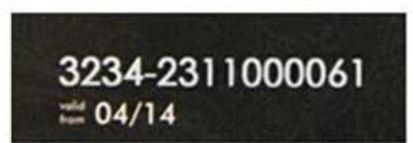
UV/Flat Serial No.