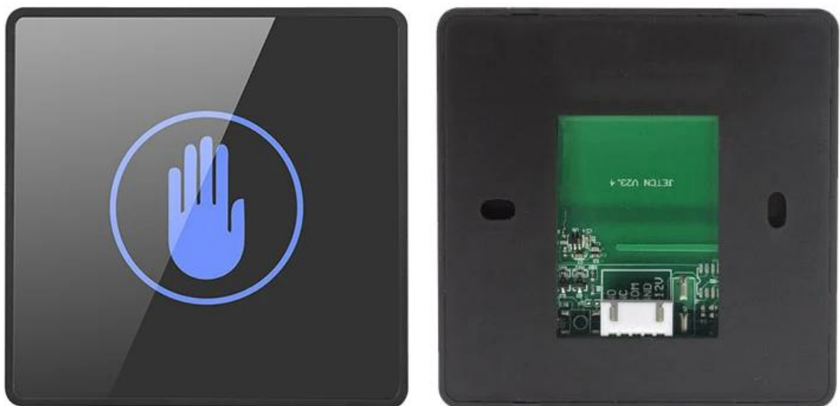
Infrared Sensor Access Control Exit Push Button