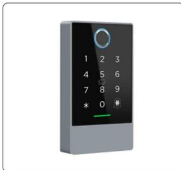
Tongtong lock version (standard)