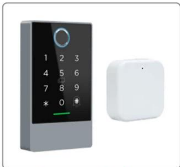
Tongtong Lock Gateway Edition