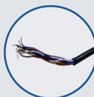
50cm cable (Standard)