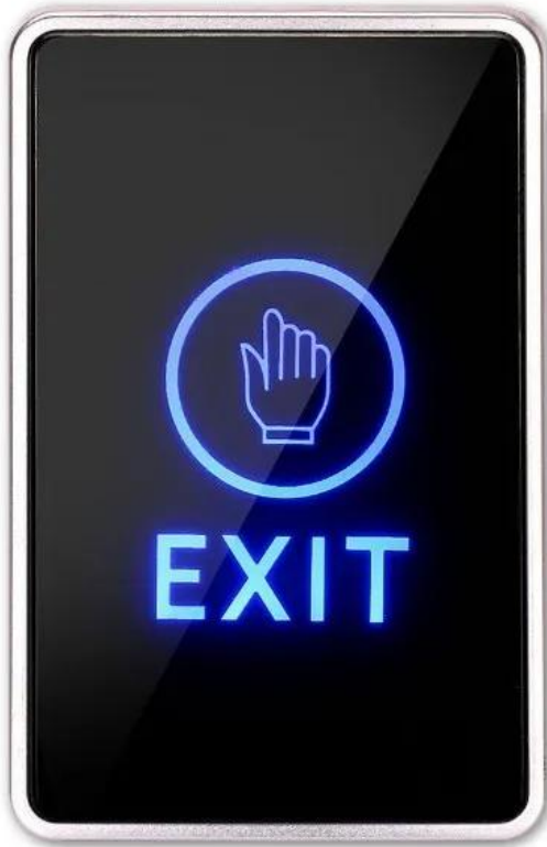
Blue Light: Standby