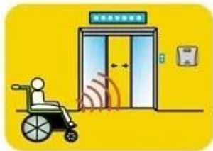
Hand free applications