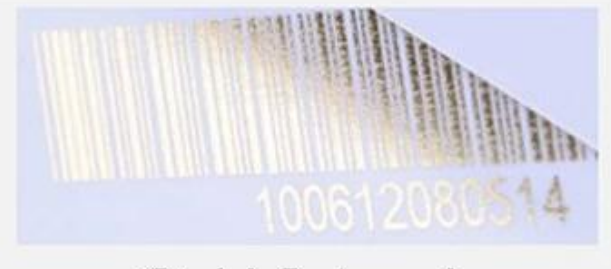
Gold flat code