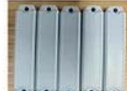
Anti-metal tag 85*20mm