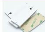
Anti-metal tag 95*25mm