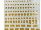
OEM /ODM PCB INLAY