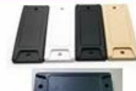
Anti-metal tag 79*30mm