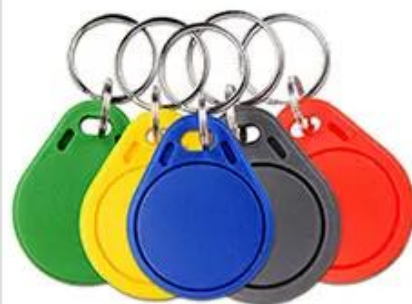
RFID Key fob