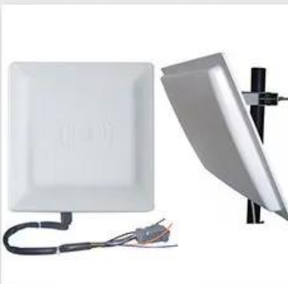
Long Distance UHF Reader