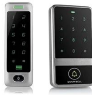
Touch Screen Waterproof Access Control