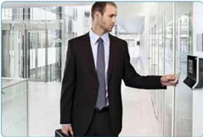
Access Control System