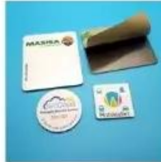
On Metal Tag