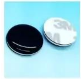
Tag with Epoxy