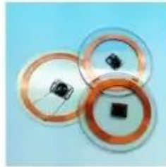
Transparent PVC Tag