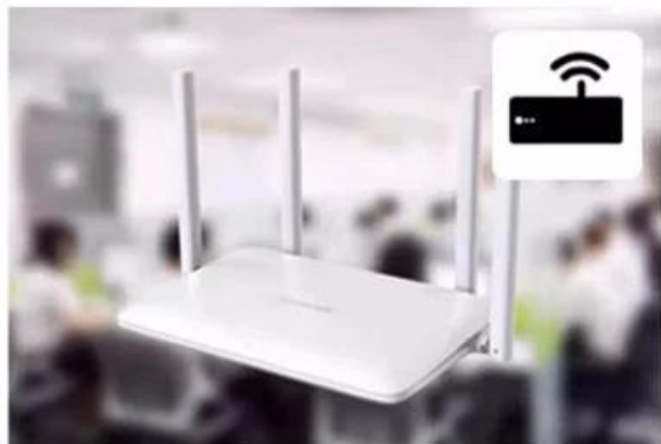
Use router to link with WiFi