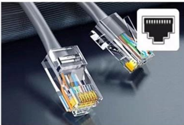
RJ45 network cable