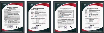
RFID Card Reader CE RFID Card Reader Rohs UHF Reader CE Certificate UHF Reader ROHS