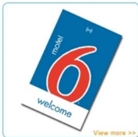
Hotel key card