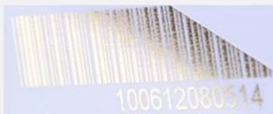
Flat numbering (golden)