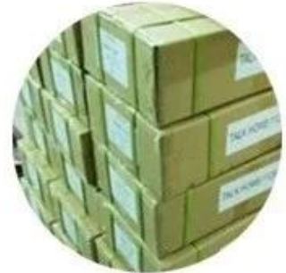
Outer carton package