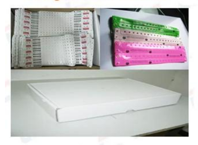
Package for Soft PVC/ Paper Wristbands