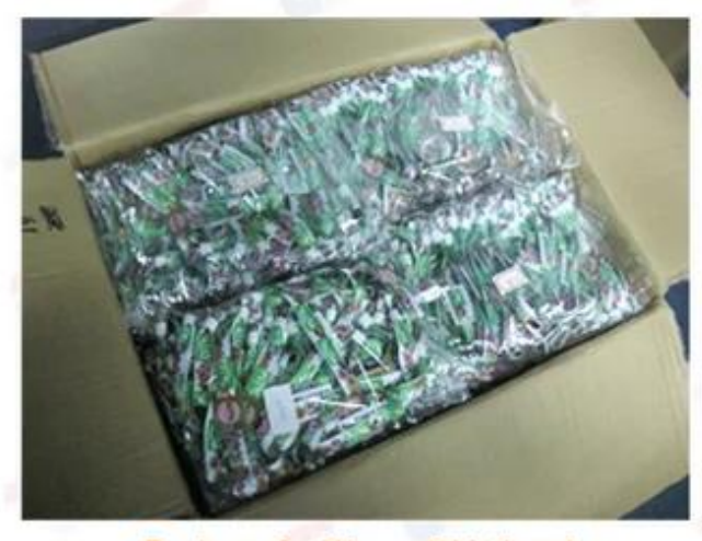
Package for Woven Wristbands