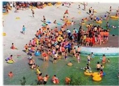
Hot Spring Hotel/Spa