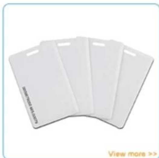
Access control card