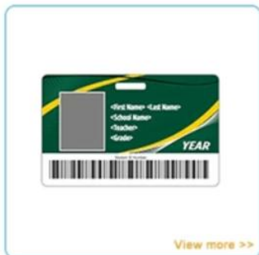
School ID card