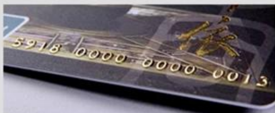
Embossed numbering (Golden)