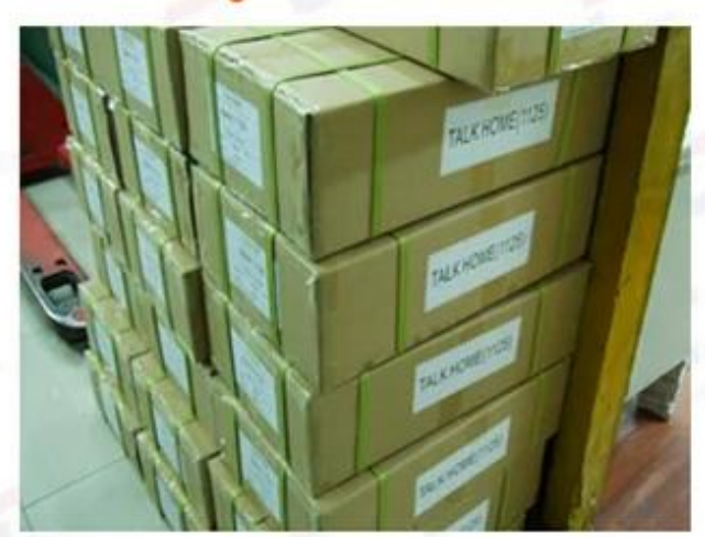
Outside Carton Package

We are professional suppliers of full security access control products with 20 years of experience, we make sure to offer the best access control system solution! Then, submit your inquiry details below, click "Send" now!