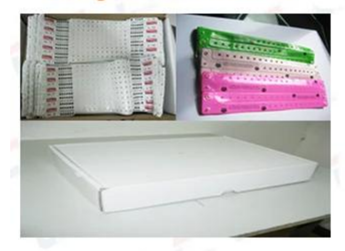
Package for Soft PVC/ Paper Wristbands