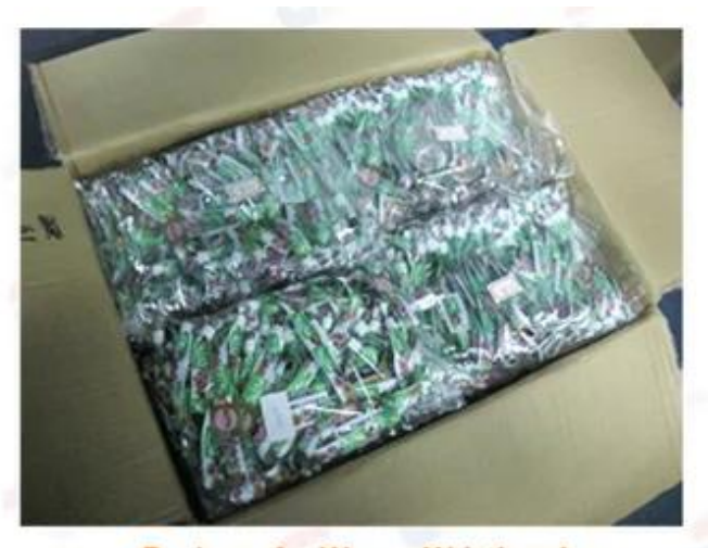
Package for Woven Wristbands