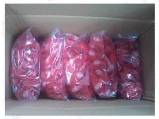
Package for Silicone Wristbands

High quality RFID silicone wristbands for events RFID waterproof wristbands nfc wristbands Ntag213 / 215/216 rfid silicone strap