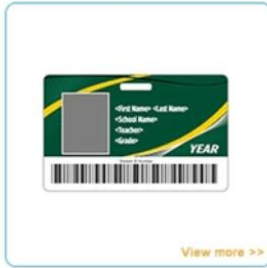
School ID card