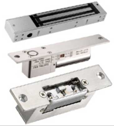
Door EM Lock