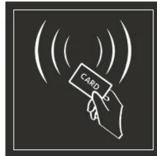
ID EM Cards