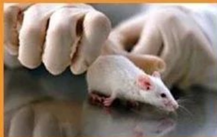
Small animal ID