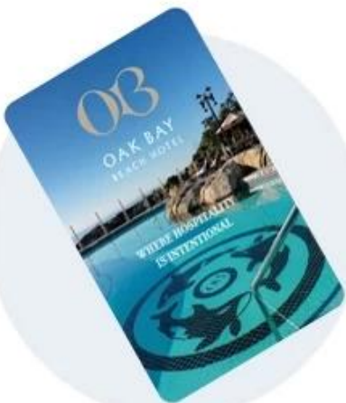
Hotel Key Card