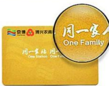
Hot Laser Silver