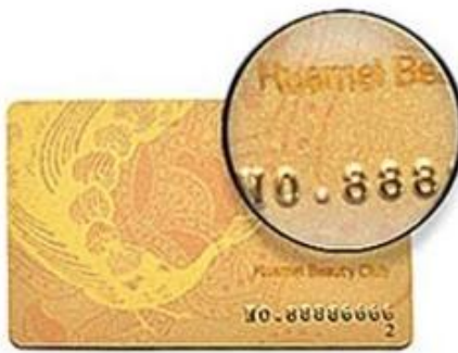
Gold Stamping Embossed Number