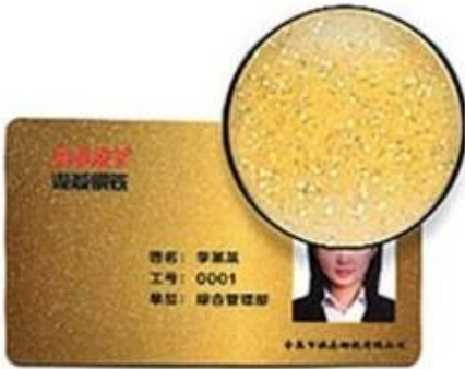
Gold Frosted Finish