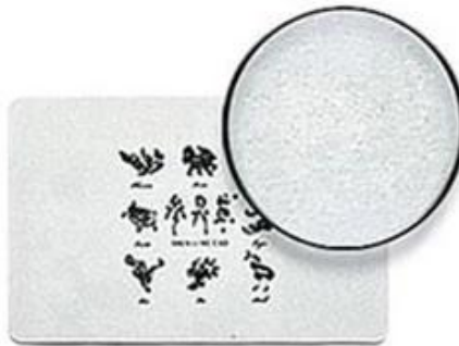
Silver Frosted Finish