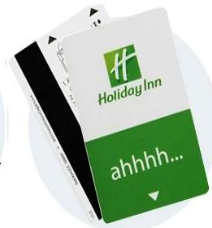
Magnetic Stripe Card