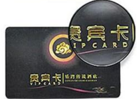
Hot Gold Lettering

We are Producing different RFID Smart Card with different code number