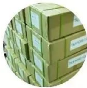
Outer carton package