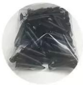
1000pcs per carton