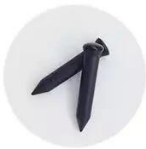
Rfid nail tag