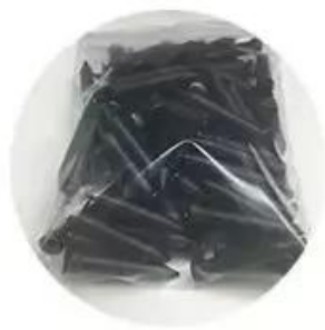
100pcs per box