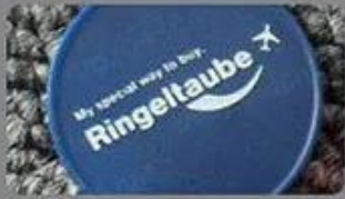
Silk screen printing