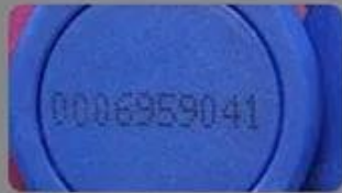
Spray printed number