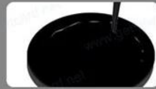
Potting of smidahl