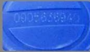
Laser engraved number