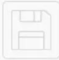
Fingerprint x 20