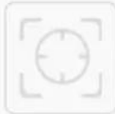
Recognition within 0.3S