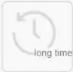
Long Standby Time