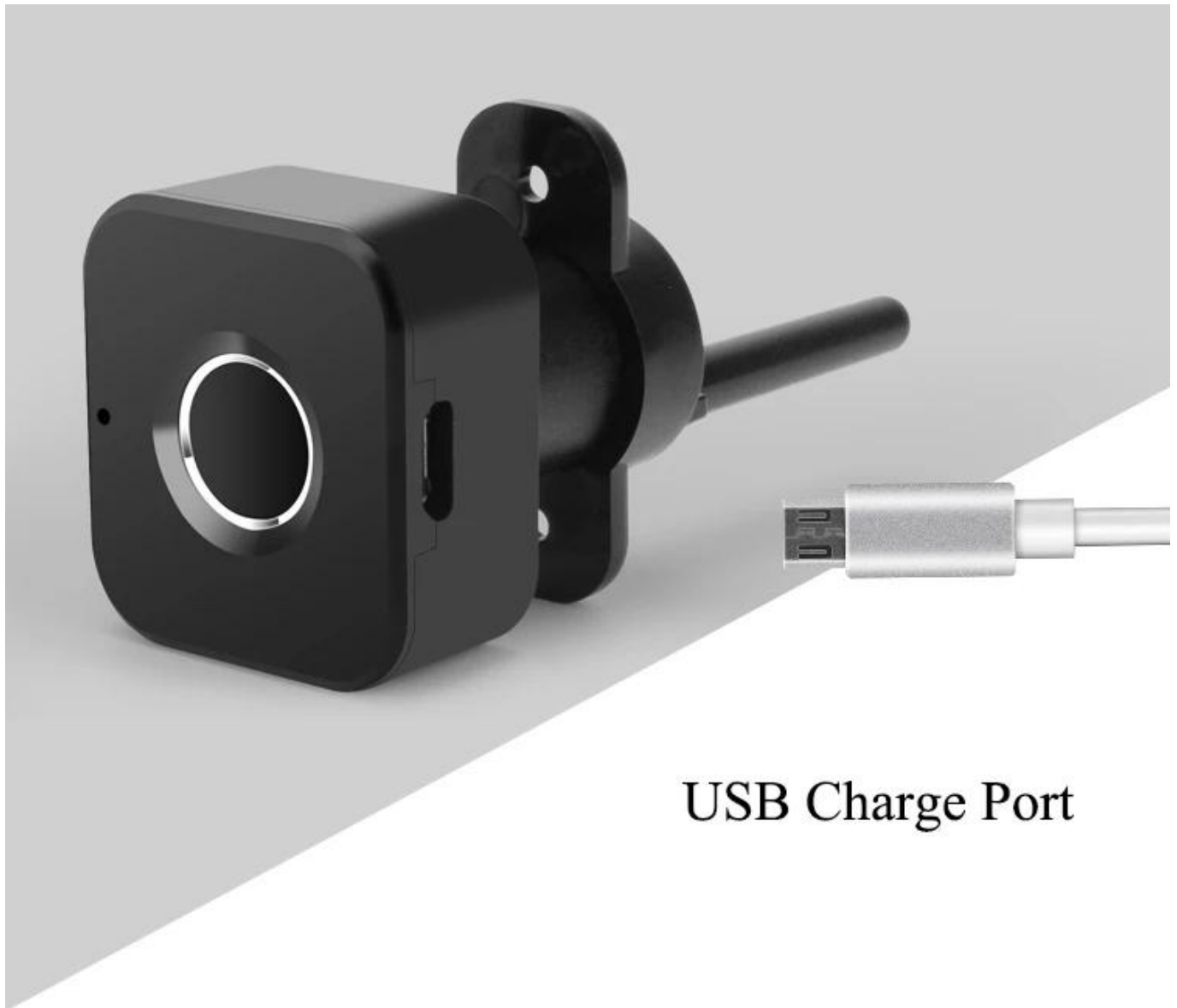
USB Charge Port