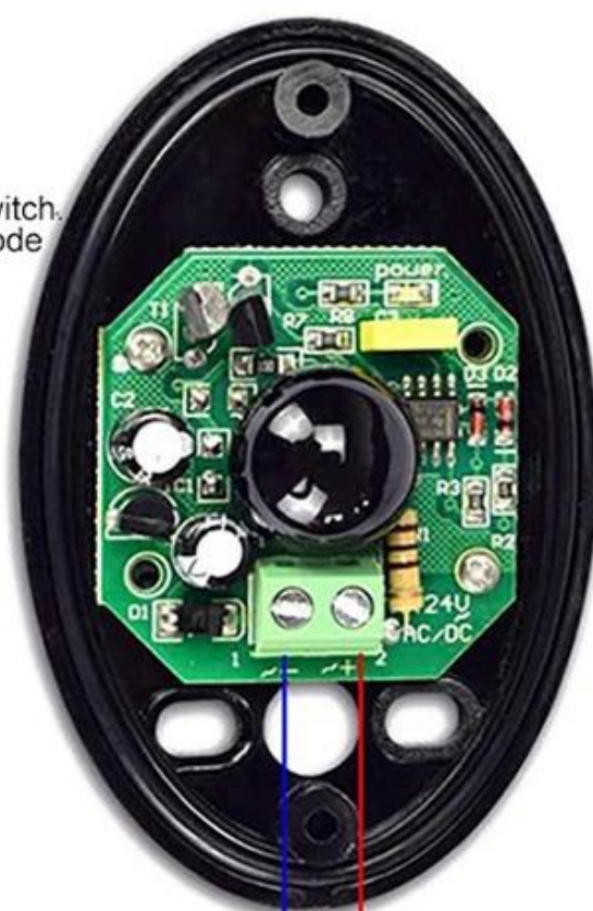
Infrared light projector