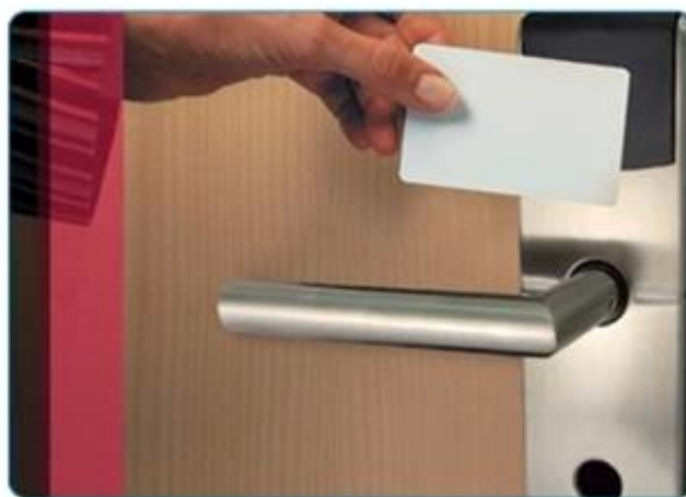
Hotel Card Application