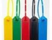
RFID Cable Tie Tag