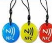
NFC NTAG213 Tag