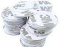
ID/IC Dia 25mm