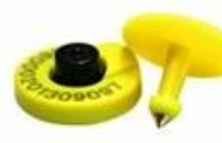
Cattle Animal Ear Tag