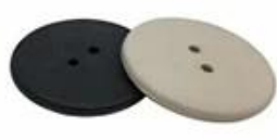
Laundry Washable RFID Tag