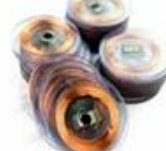
ID/IC Tag Dia25mm