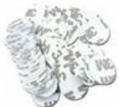
Coin Tag ID/IC 20mm