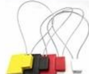
UHF Seal Rfid Tag