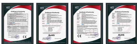
Access Control CE Access Control RoHS EM Lock EMC Certificate EM Lock ROHS Certificate