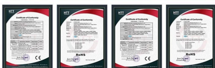
RFID Card Reader CE RFID Card Reader RoHS UHF Reader CE Certificate UHF Reader ROHS