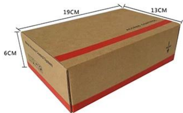
Product box size