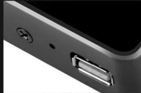
U disk transfer information.