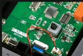
Tamper alarm function