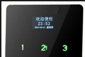
OLED LCD screen