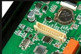
Import ARM32-bit CPU system