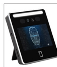
ACM-TM05 Face Recognition Face Recognition

New Mini Metal Waterproof RFID & Fingerprint Outdoor Standalone Access Controller