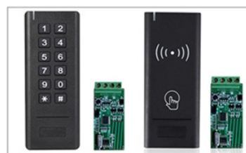
ACM-302 ACM-305 Wireless WiFi Access Control Reader

TUYA APP Smartphone Bluetooth Waterproof Keypad RFID /Fingerprint Access Control