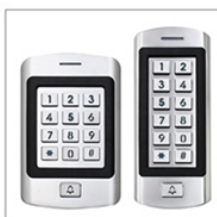
ACM-209 C/ D