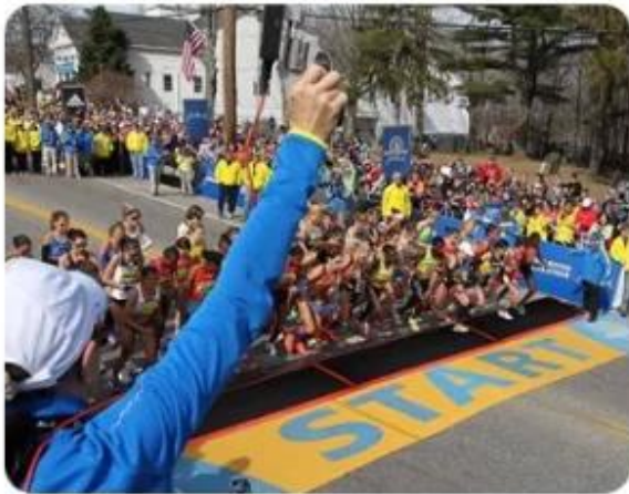
Sports timing system