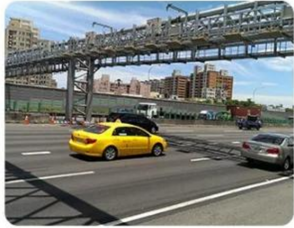
Vehicle tracking system