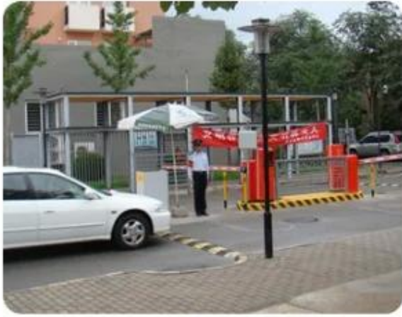
Parking lot vehicle access control system