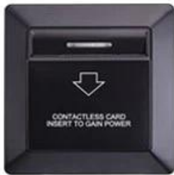
Energy Saving Switches