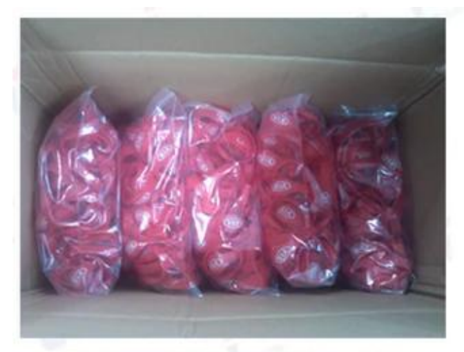
Package for Silicone Wristbands

High Quality RFID Silicon Wristbands for Events Waterproof RFID Wristbands bracelet nfc Ntag213/215/216 silicon rfid wristband