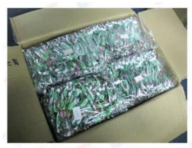
Package for Woven Wristbands