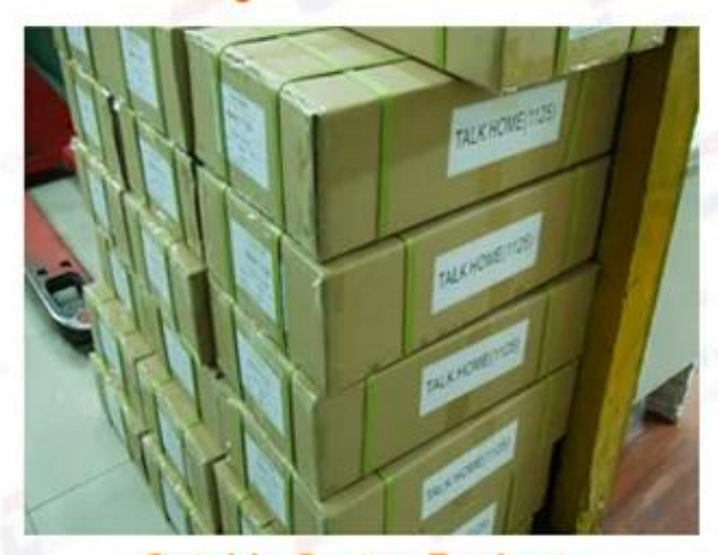
Outside Carton Package