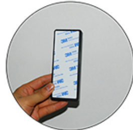
Stick it on the back of the reader