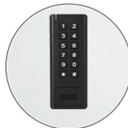
Stick the reader on the door