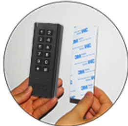
3M sticker for Wireless reader