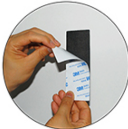
Rip one side of the sticker