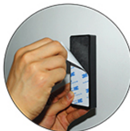
Rip the other side of the sticker