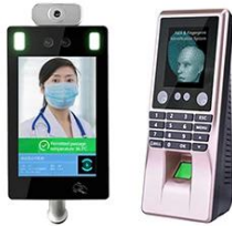
Face Biometric Thermometer Access Control