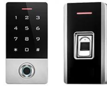
Fingerprint Biometric Access Control