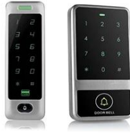
Touch Screen Waterproof Access Control