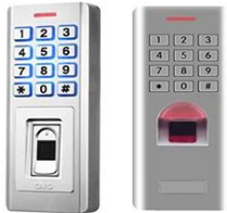
Fingerprint Standalone Controller