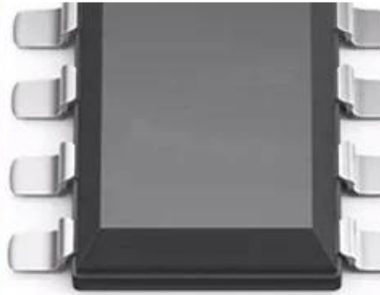
100000 data storage