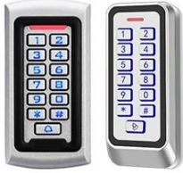
Waterproof Metal RFID Access Control