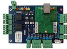
Network TCP/IP Access Control Board