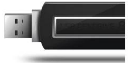
8GB USB flash drive