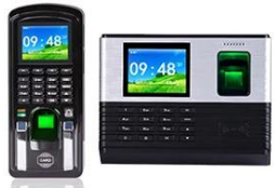
Biometric Access Control & Time Attendance