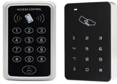
RFID Door Access Control